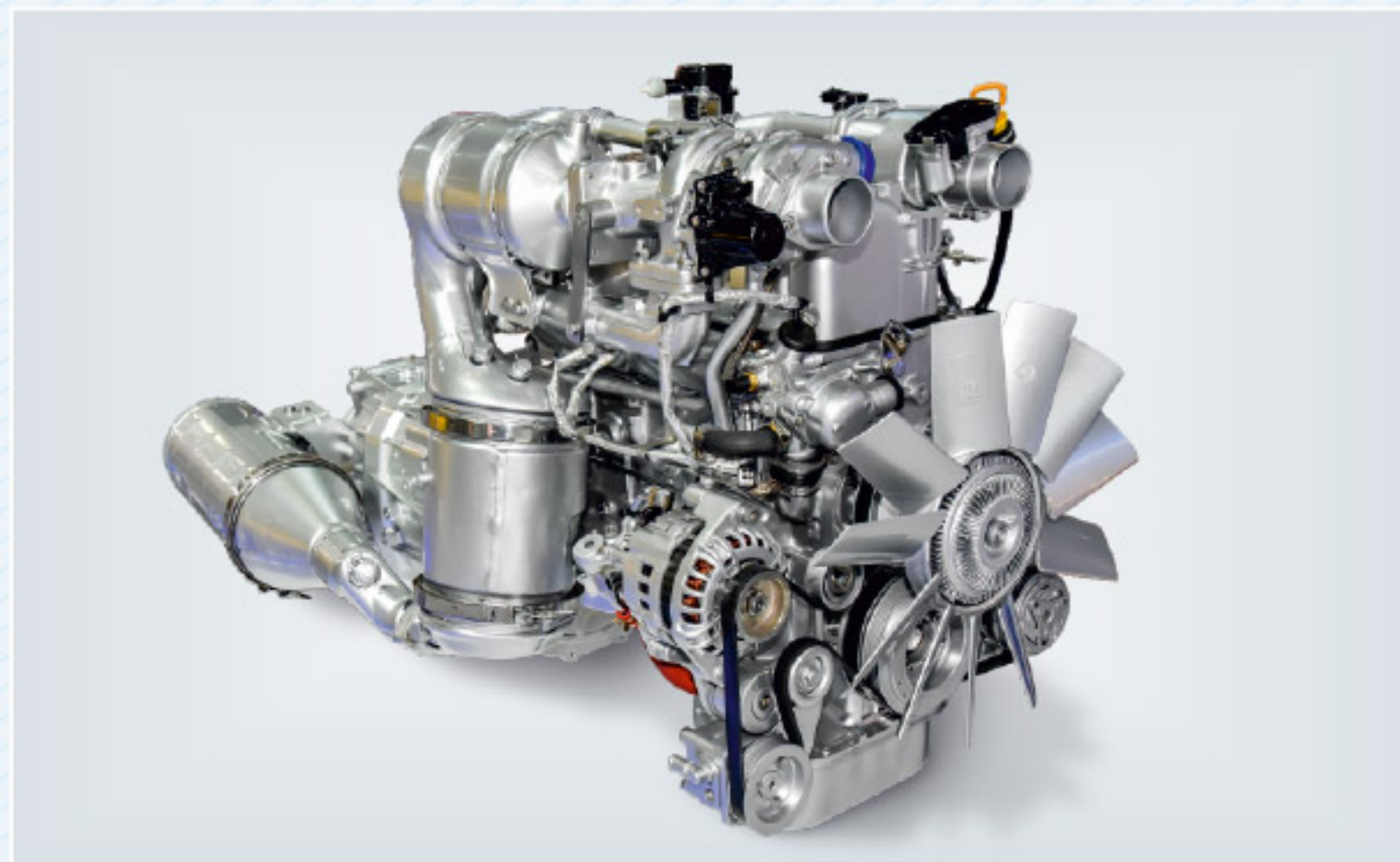
Mercedes Derived, FM2.6 CR CD, BS-VI Engine Powerful & Fuel Efficient

NEXT GENERATION MODULAR UTILITY VEHICLE PLATFORM : The TRAX Cruiser, India's popular people mover gets a total makeover. It now comes with a new more powerful Common Rail Engine, a new high strength C-in-C steel chassis, a new modern and more spacious body with new premium interiors. This new platform has been developed keeping in mind all aspects of convenience, safety, ergonomics, drivability and passenger environment.