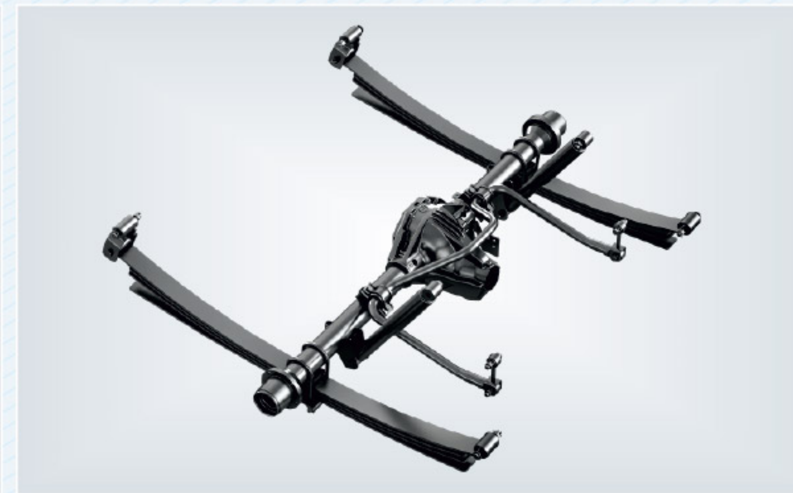
All-New Suspension Excellent Ride Comfort