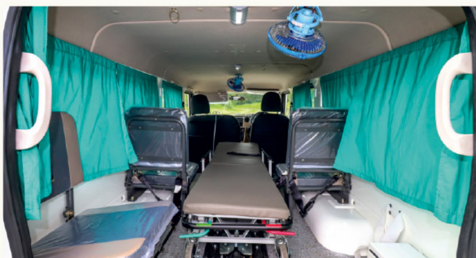
Foldable seats for convenient movement, Swivelling Fans and Ample lighting