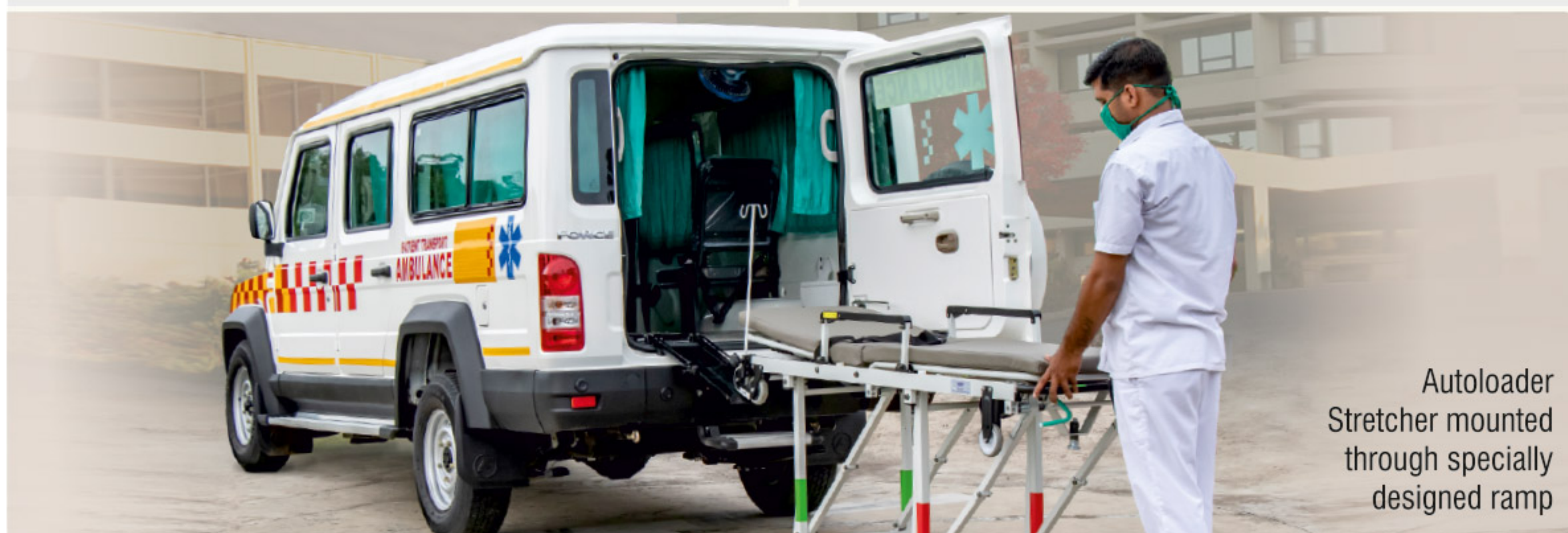
Autoloader Stretcher mounted through specially designed ramp