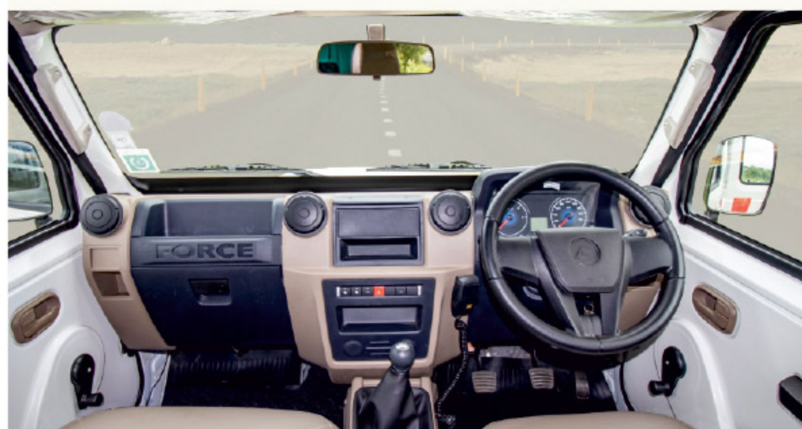
All new interiors, new seats, dual tone dashboard and new instrument cluster

The fully factory built, All New Trax Ambulance is ready to use from day one. The independent front suspension and parabolic rear suspension ensure best in class ride quality for the patient. The new G-28 Synchronesh Gear Box with Cable Shift ensures smooth and quick gear changes. The Trax Ambulance is ideal for use in narrow congested lanes and the rough road conditions in the rural areas.