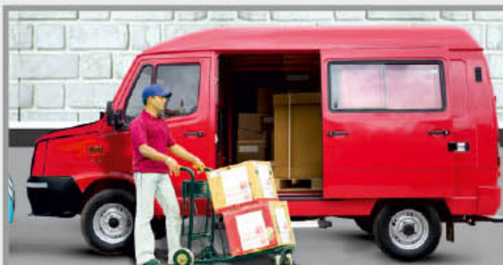
Sliding door (option) for kerb side delivery